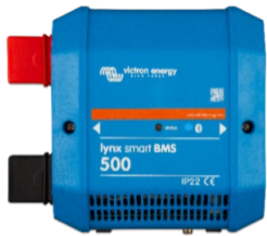
Lynx Smart BMS 500 A