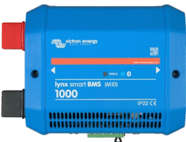
Lynx Smart BMS 1000 A