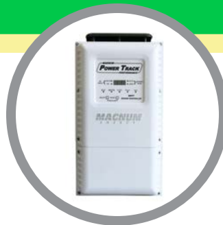
Up to seven (7) PT-100 Charge Controllers for 42kW output at 48V