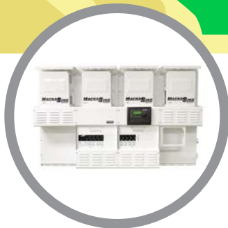
Magnum Energy MPDH Panel and four MS-PAE Inverter/Chargers